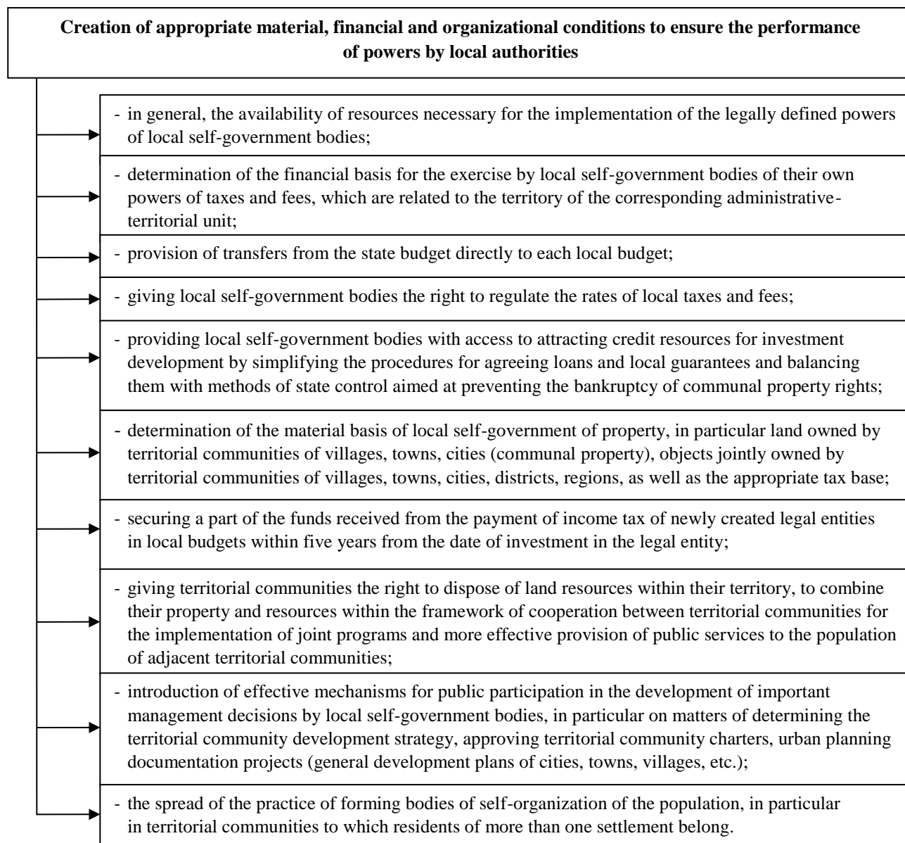
Figure 2. The main components of management of resource development and nature management of the agricultural sector in the reform of local self-government

This requires the creation of appropriate material, financial and organizational conditions, as well as the formation of personnel, which must ensure the implementation of the relevant powers within a certain territorial community. From the point of view of resource management of the agricultural sector, it is important to adhere to the original provisions of the Concept, the main ones of which are shown in Figure 2.